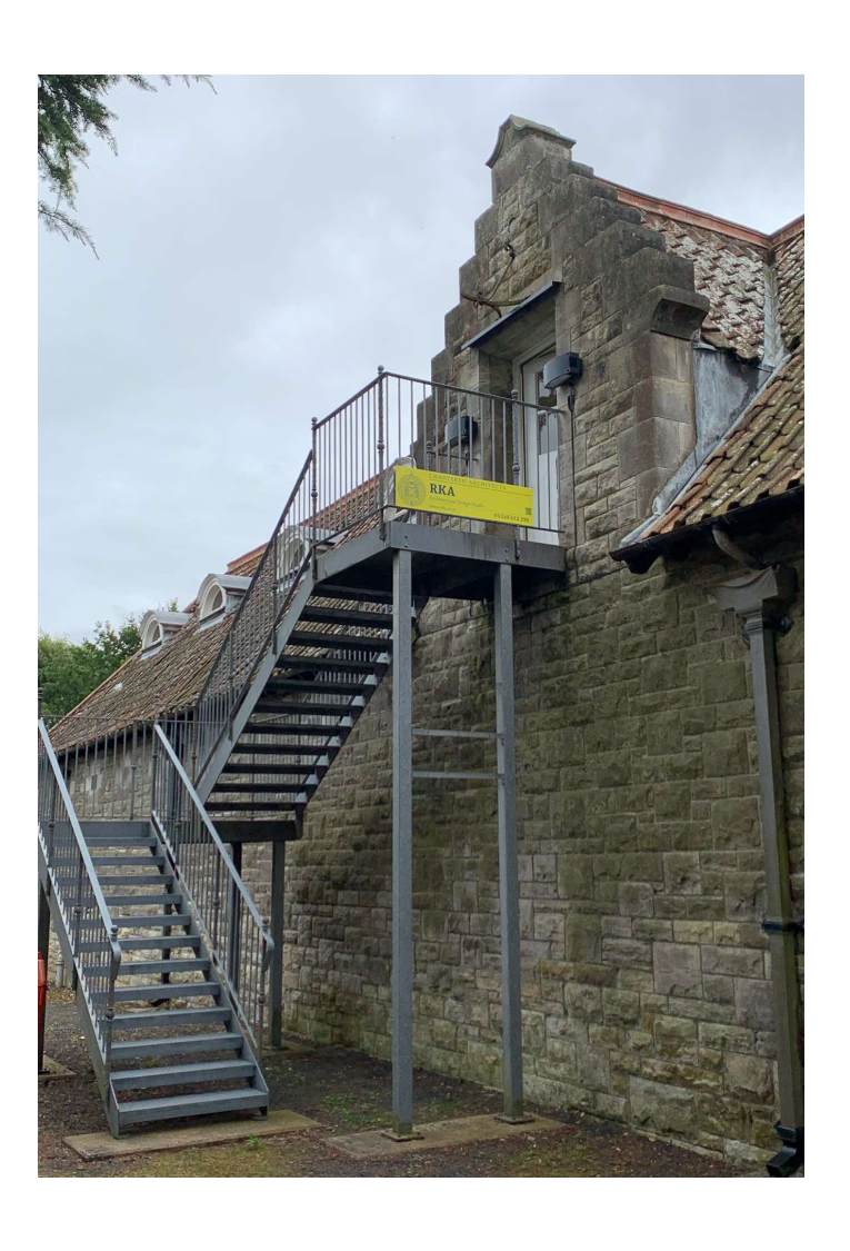
Access on private road from Mount Melville